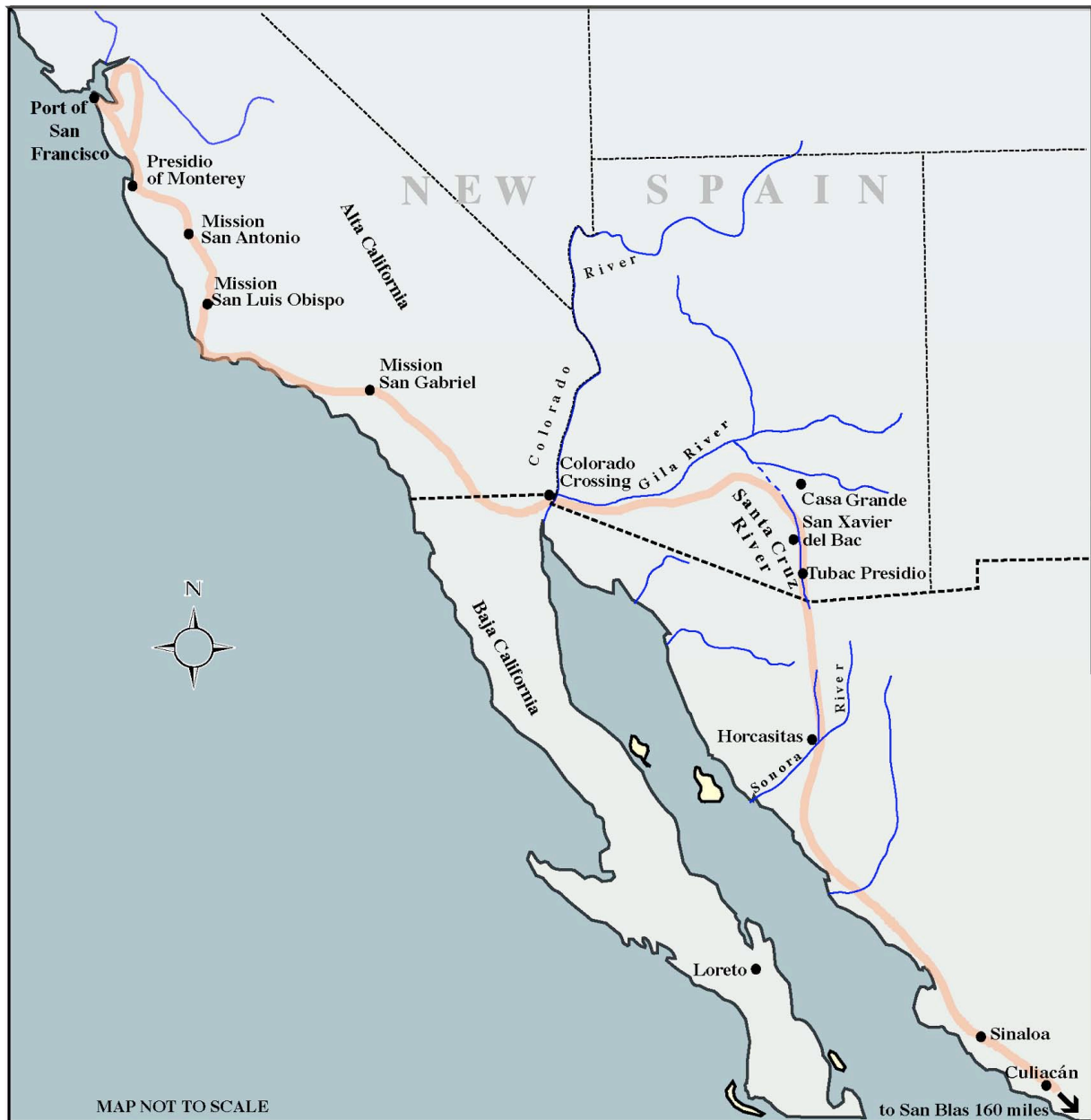
The route of Anza's second expedition (1775-1776) to Alta California .