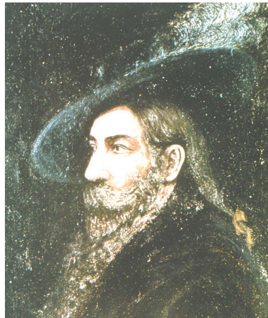
Juan Bautista de Anza from an unsubstantiated French painting