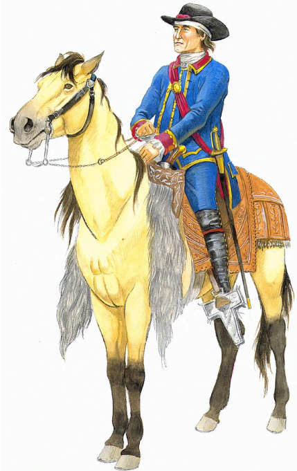
A clean-shaven Juan Bautista de Anza