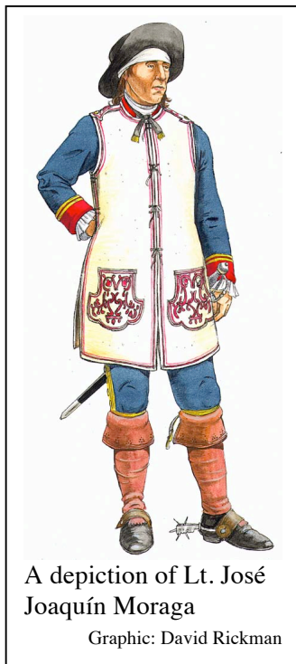
A depiction of Lt. José Joaquín Moraga

As the expedition rested and became acquainted with Monterey, Anza set off to determine the location of the new San Francisco presidio and mission. Joined by Font, Lieutenant José Joaquín Moraga, and a small group of soldiers, they traveled to San Francisco and surveyed the area. He quickly determined the best sites for the presidio and mission and left San Francisco to explore the East Bay. Directed by the Viceroy to determine if there was a river flowing into the bay, they followed the shoreline south to the tip of the bay (now Alviso, north of San José) and then up the eastern shore. Arriving at Carquinez Strait, they continued east along the shoreline, unable to determine whether there was indeed a river flowing into the bay. As his men became increasingly bogged down in the tules, Anza abandoned the quest and headed south, to return to Monterey. From there, Font, Anza and ten of his core soldiers from Tubac, and one dissatisfied couple, made their way back to Mexico along the trail. Anza left Moraga in charge of the expedition.