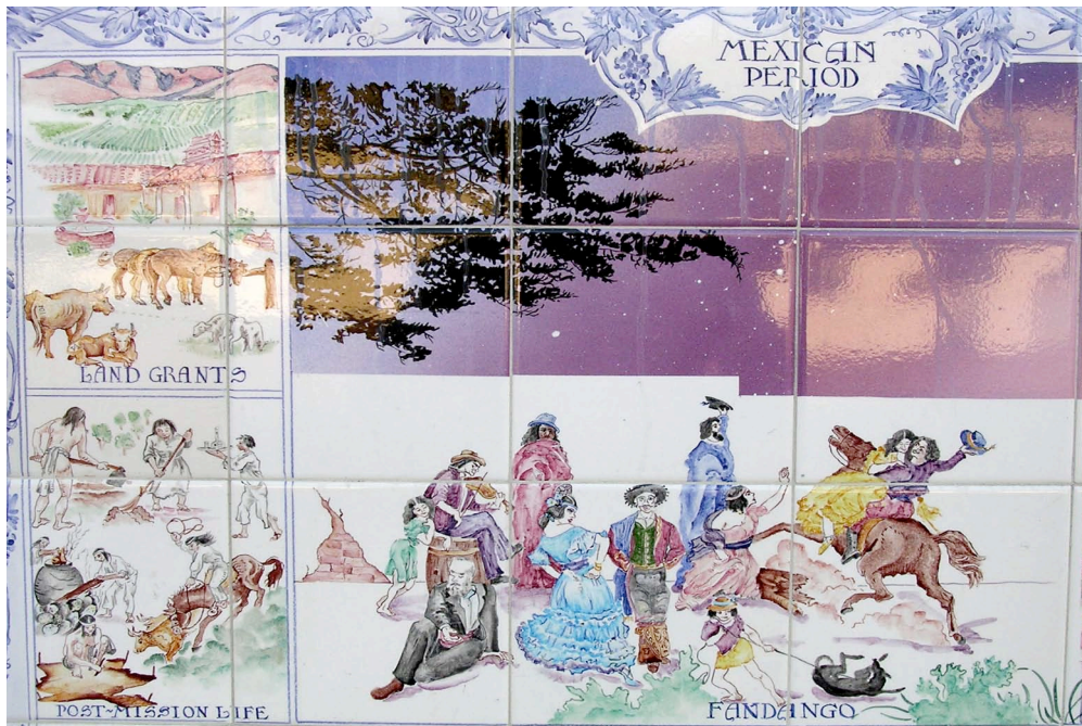
Painted tiles at Monterey's Customs House Plaza near the Pacific House depicting the life of Anza's colonists during the Mexican Period.

Meanwhile, back in Alta California , the presence of those brought to California on the Anza trail radically altered the course of Spanish colonization. Cut off to a large degree from the colonies to the south, the children and grandchildren of Anza's colonists created a unique culture and began to refer to themselves as " Californios ." To this day, many of their descendants still refer to themselves as such. The Juan Baustista de Anza expeditions of 1774 and 1776 not only fundamentally changed the nature of California, they allowed for the founding of San Francisco and San José, and the beginning of eighty years of Spanish Californio Rancho culture.