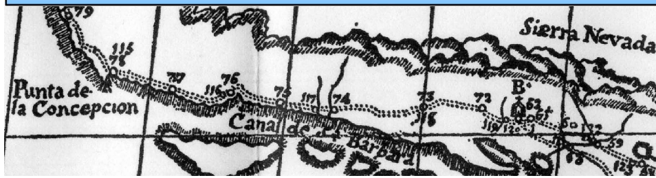
A detail of Font’s map shows the “Channel of Santa Barbara” with five islands, including Santa Cruz. Mission San Gabriel is labeled at “B” (camp #62) on the right side.