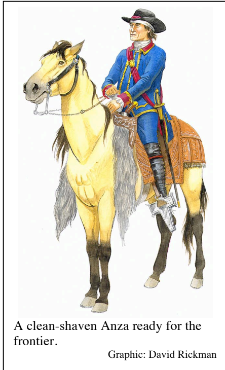
A clean-shaven Anza ready for the frontier.