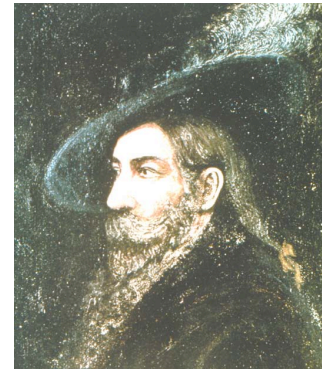
One of several unsubstantiated portraits of Juan Bautista de Anza.

Anza was away on two trips to Alta California ; his wife remained in Tubac. Anza would be away for about eight months during the 1775-76 colonizing expedition serving his king, Carlos III of Spain.