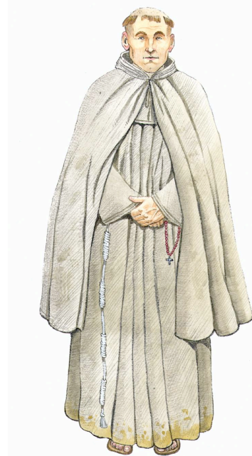
Franciscan priest Father Pedro Font, diarist and Chaplain of the 1775-1776 Anza Expedition.

"Diary of the march and explorations which I, the undersigned lieutenant colonel and captain of the Royal presidio of Tubac in the province and government of Sonora, am making a second time from the foregoing province to northern California. By order of the most excellent Señor Baylio Frey Don Antonio María Bucareli y Ursúa, Viceroy, Governor, and Captain-General of New Spain, as is shown by his superior decree of the 24th of November of the past year of 1774, for the purpose of escorting thirty soldiers with their commander and sergeant to the California named, for the reinforcement of the Royal Presidio of San Carlos de Monte Rey, and for the establishment of the port of San Francisco, all married and all recruited in the province named, and whose women and children and other dependents are set forth more at length below, together with the total number of those going upon this expedition..."