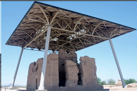
Picacho Peak (at far left) and the Casa Grande Ruins.