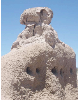
Adobe ruins at the Casa Grande