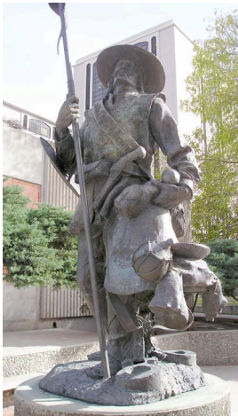
A Soldado de Cuera statue guards downtown Tucson.